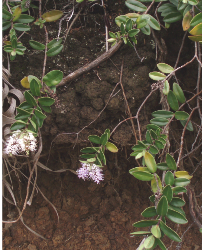
Anawhata Beach Track, 19 Apr 2008

If you are receiving this newsletter by post but would prefer to receive it (as a .pdf file) by email, please let us know by emailing us at wrps@waitakereranges.org.nz . You will have the added advantage of being able to view the photographs in full and glorious colour.